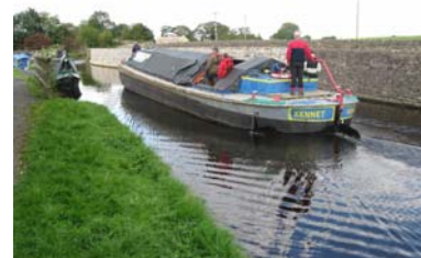
New addition Kennet

(narrow boat); Marjorie R (coal barge); Mr Toots (service launch); Rosenn (Solent One Design); Victoria (narrow boat) and Wheldale (tug).