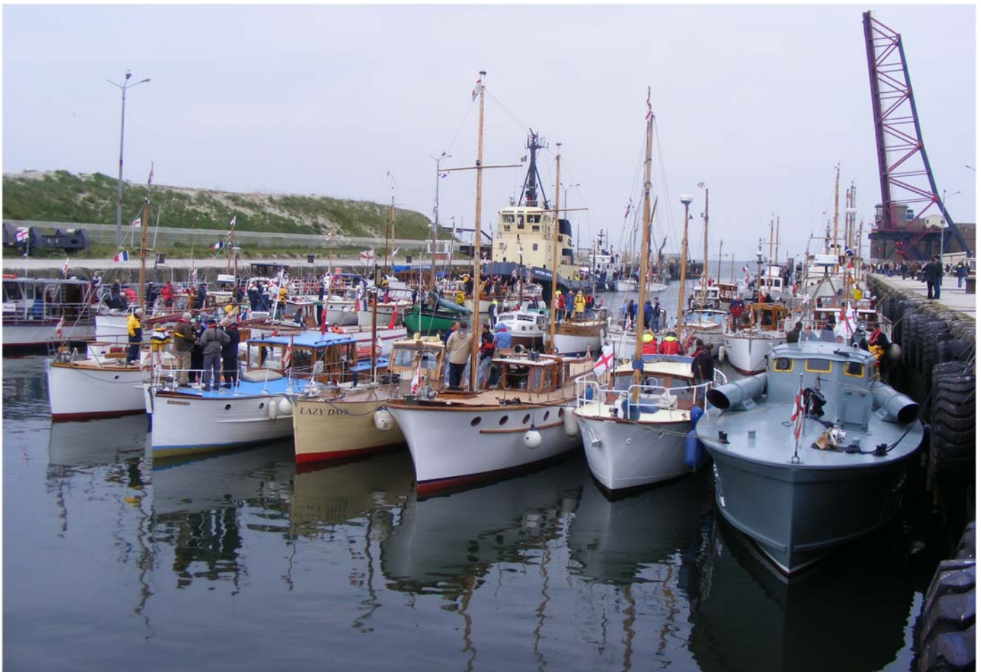
The ADLS fleet arriving at the lock in Dunkirk

Footnote: National Historic Ships was delighted to see that three of the Dunkirk Little Ships flew our new house flag at this event.