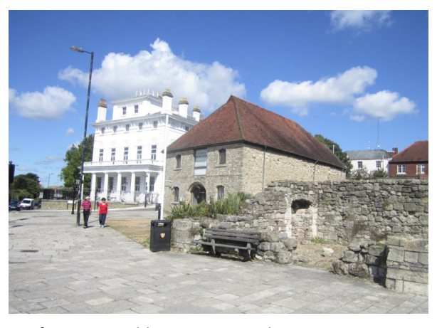
Southampton Maritime Museum Service Both images © Brian Lavery

To set the exact terms of the enquiry, including the boundaries of the term 'maritime', the subject fields to be covered and the level of detail; to identify the museums and archives which were likely to have maritime collections; to study the relevant collections using electronic sources such as websites and catalogues, and printed sources as published or supplied by the relevant curators; to visit all museums and archives with significant maritime collections, discussing with curators and looking at some of the objects and documents; and finally to produce an interim and then a final document.