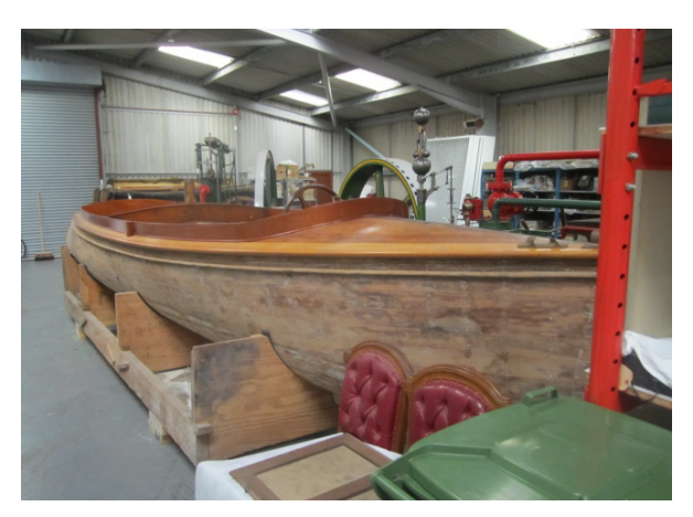
The store of the Isle of Wight Museum

Synergies were identified in the following nine areas: