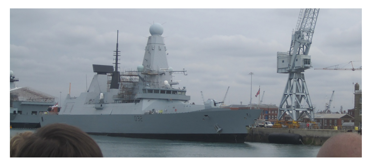
A new Type 45 destroyer in Portsmouth

Most of the museums in the area have some artefacts from local craft and dinghies, and often have sets of shipwrights' tools on display. Shipbuilding has recently revived in the area with the building of sections of the Type 45 Daring Class frigates by Vosper Thornycroft in Portsmouth Dockyard. This was effectively displayed during the Trafalgar 200 event in 2005.