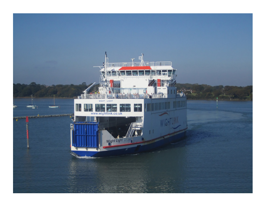
The Wightlink ferry coming out\ of\ Lymington.