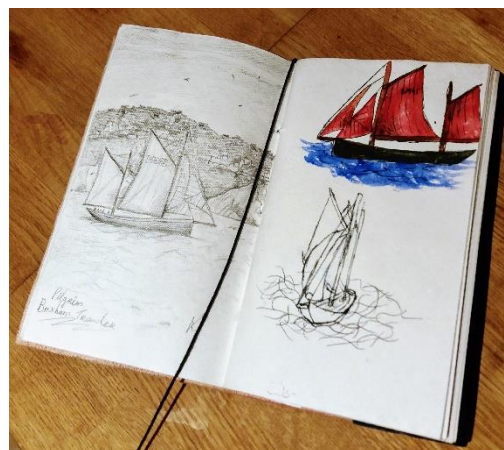
Some Sketches of the Beautiful Pilgrim

Next was the mallet. This project was particularly interesting, as it involved more complex curves than what we had done previously. A mortis had to be chiselled out of the head of the mallet so that the tapered handle would slot through it perfectly. While it got quite frustrating, it was really quite rewarding when it finally fitted together. I also got a head start on Christmas presents this month by making my Grandpa a set of mahogany coasters. I really love that the instructors at college are so helpful when you try out some of your own projects.