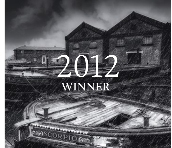
Scorpio , by Ian Kippax.