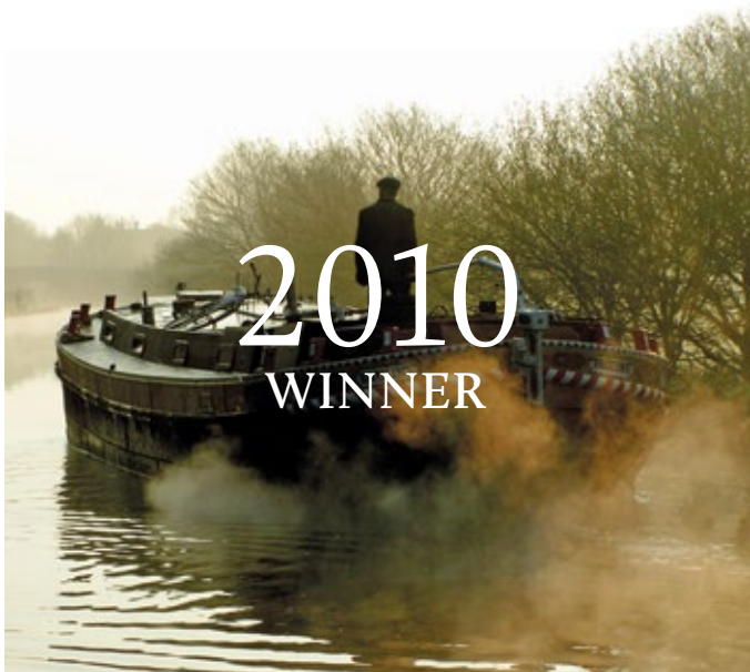
Calder & Hebble Keele Pauline