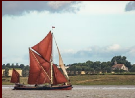
Highly Commended: Under Sail , by George Fisk, from Whitstable, Kent.