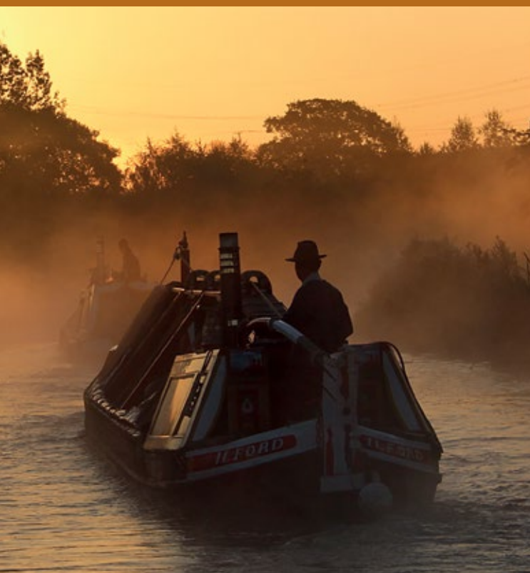
Left: Photo Competition ■ Overall winner Butty boat Ilford breaks the September dawn, by Teresa Fuller.