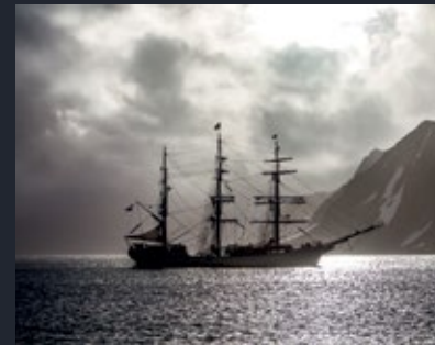
Highly commended: Bark Europa at Fort Point, Antarctica