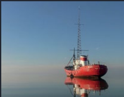
Highly commended: MV Ross Revenge, the home of Radio Caroline 1