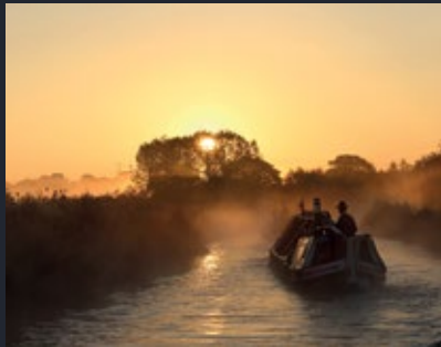
Overall & category winner: Butty boat Ilford breaks the September dawn