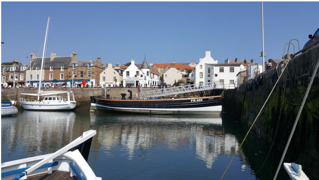
Reaper FR 958 in Anstruther Harbour just outside the Scottish Fisheries Museum.

I also started helping with maintenance work aboard Reaper , the museums Fifie herring drifter that is in Anstruther harbour.