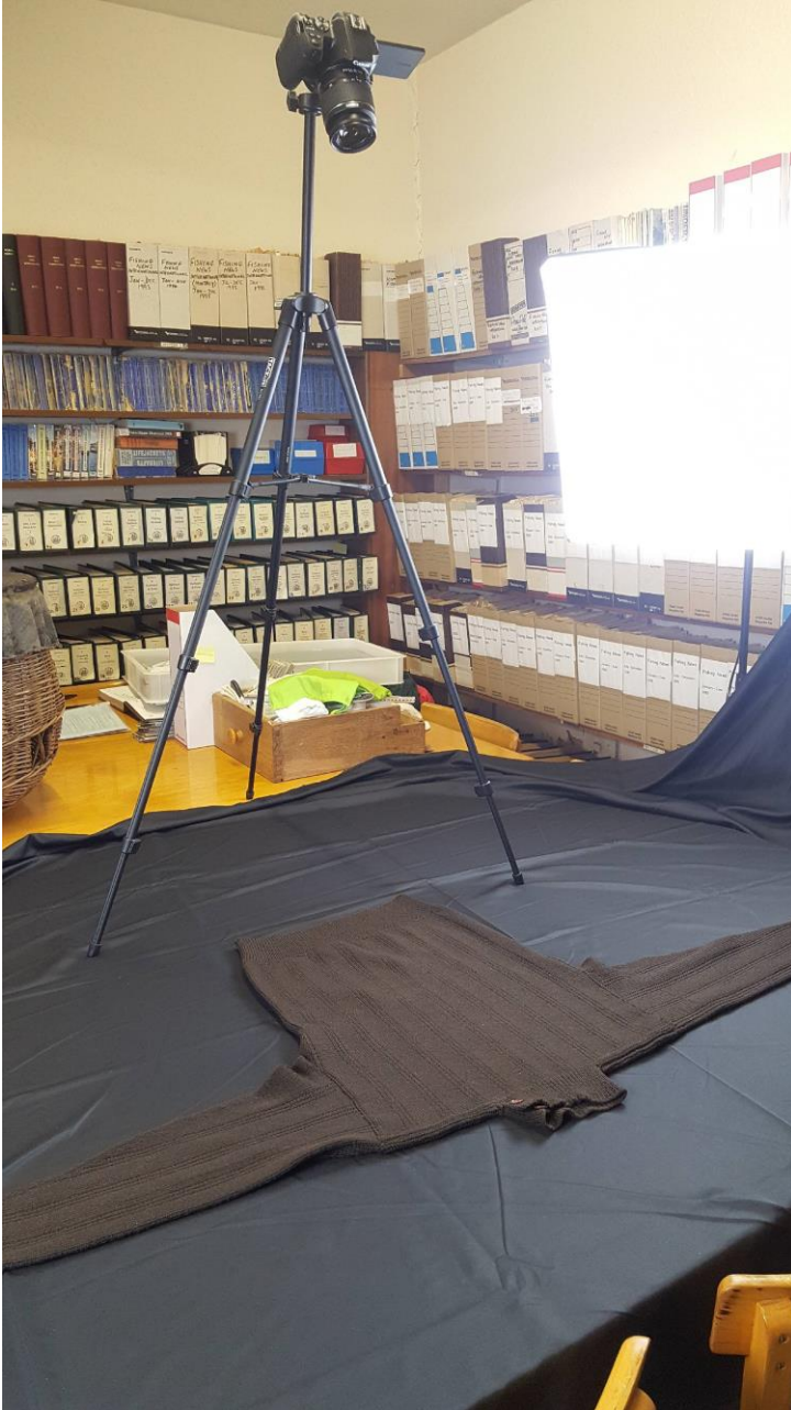
The setup for photographing the gansey collection which includes handling the collection, photographing the collection then adding to the database forms.

During the month I also helped with the project 'Knitting the Herring'. The project focuses on workshops, exhibitions and events to record and celebrate the unique knitting heritage of coastal fishing communities in Scotland. Part of the project is documenting the Scottish Fisheries Museum gansey collection. Ganseys were originally designed to provide protection for fishermen out at sea.