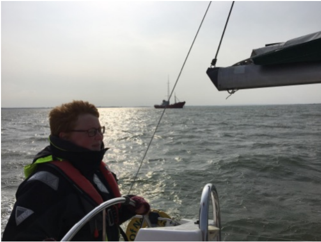
Left: Steering us past the Ross Revenge, aka Radio Caroline in the Blackwater.

It was super fun too, we anchored up near a little group of seals chilling on a sandbank for one night, and had some proper weather, a nice force 7. It wasn't as bumpy as I expected for the size of the boat but it still meant we didn't quite get to Ipswich.