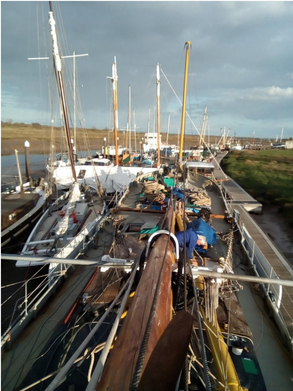
Great view from the topmast!

This week we lowered down the mainmast, so we could do a bit more painting on spots that needed it, slosed the rigging with boiled linseed oil and tar, and bent on the mainsail and topsail, including setting up the brails for the mainsail.