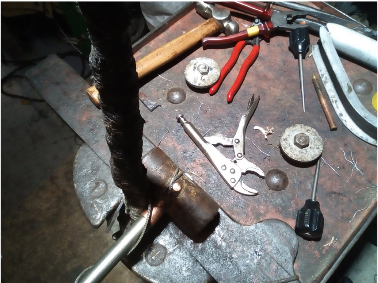
Helped ex-SHTP Tom at TS Rigging with one of the rolling vangs for Blue Mermaid— did a Liverpool splice (top left), served over it, and did a wire seizing on one of the eyes that was too big (top right and bottom).