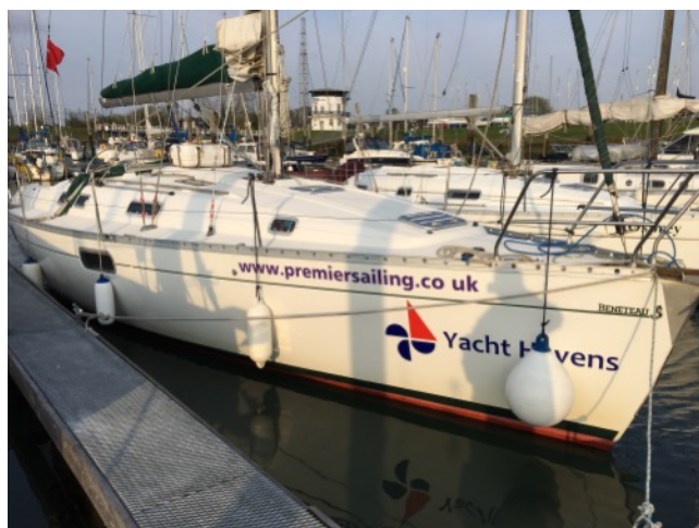
Right: The little yacht I spent 5 days on for my day skipper practical.

Day Skipper went well, I passed, and managed to go the whole week without crashing into anything or running aground so a definite win.