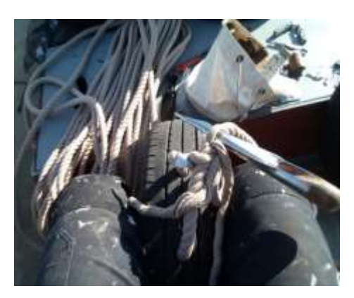
Caption: Blue Mermaid soaking up the sun

We also visited Heybridge Basin, where the Trust's little sailing dinghies are. They needed to be moved from the pontoon where they were into storage, so I got to paddle one across, towing another one behind me. Managed to get away with dry feet but a wet burn.