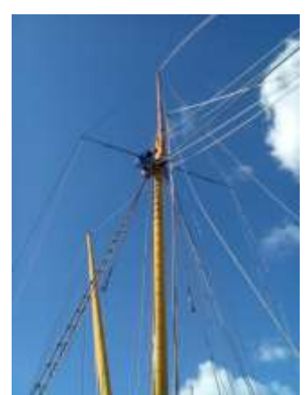
[Oli went climbing so we could lower the topmast in preparatio n for lowering down the mainmast.

Apart from all that, I've been doing whippings wherever needed, greasing blocks, lots of varnishing, made some boathooks, almost finished knitting a jumper in my spare time, and started a Day Skipper theory course.