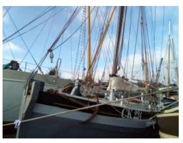
Sallie sitting on the mud next to Blue Mermaid