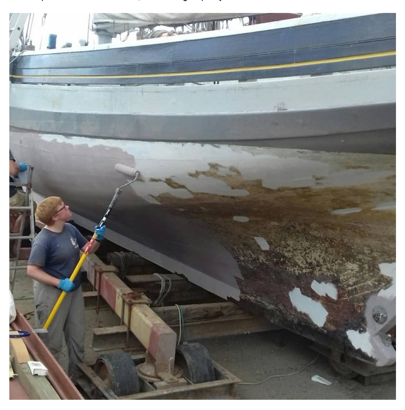
Me looking cheerful with a big roller.

We scraped and antifouled Sallie, Sea-Change's pretty little Colchester smack.