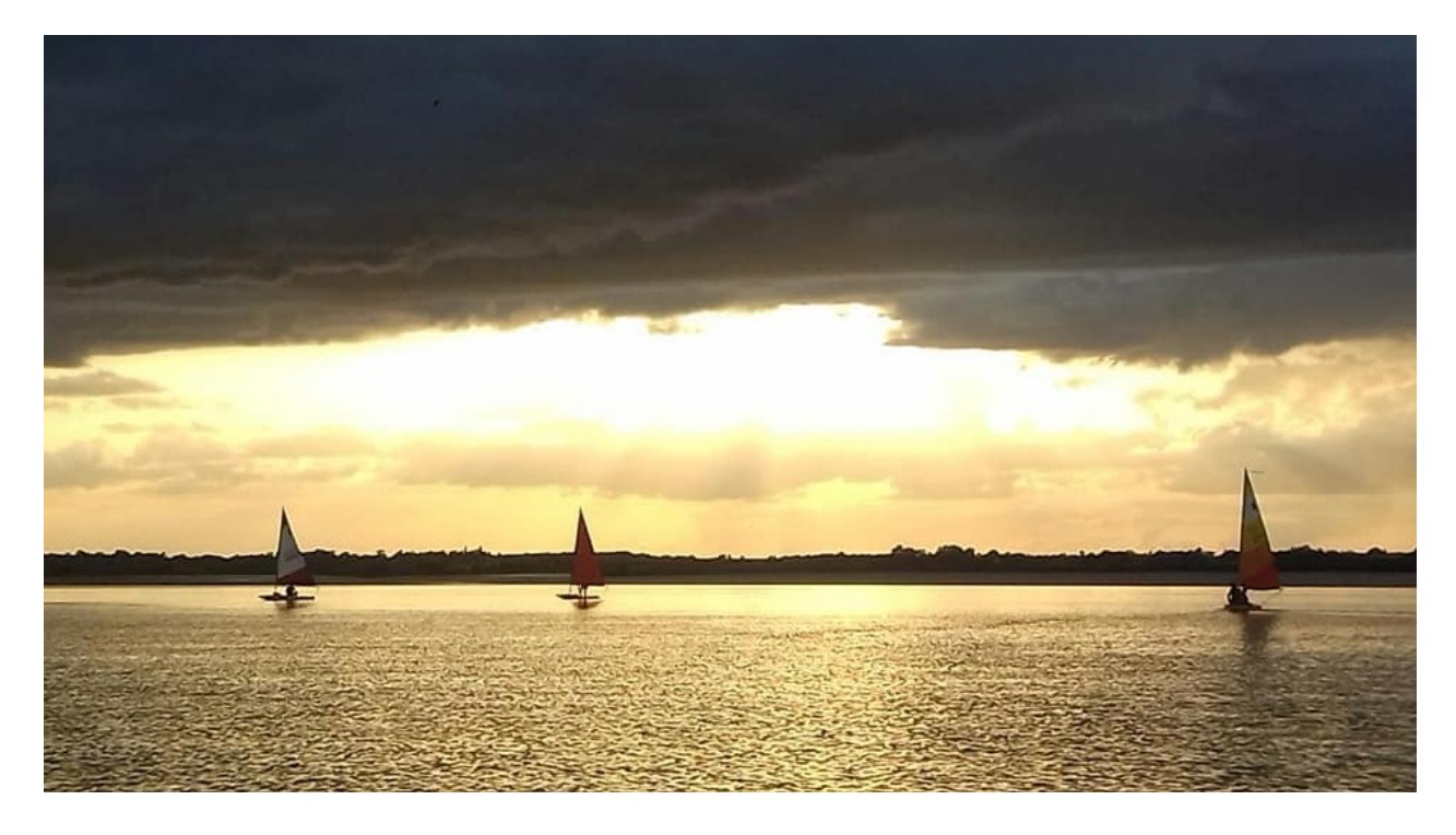
Dinghy sailors disappearing into the sunset in the Walton backwaters.