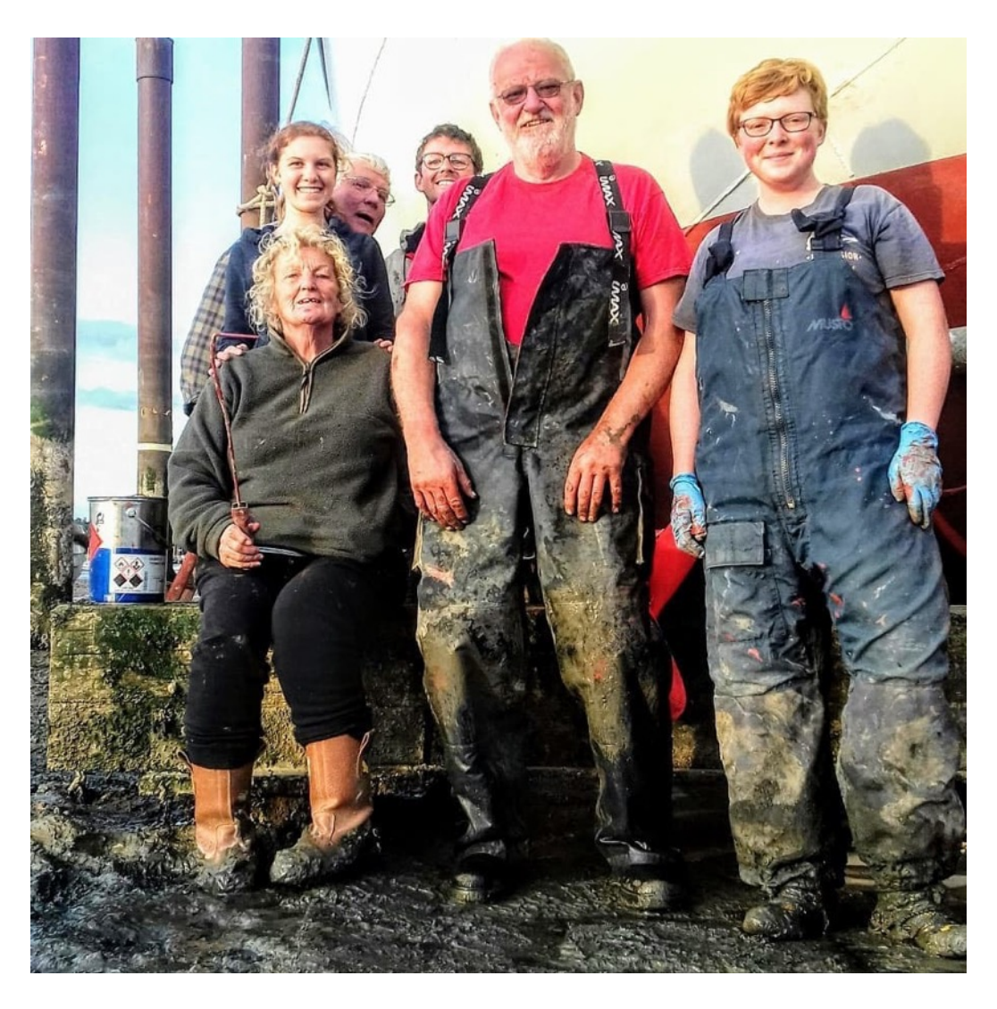
Mud larks + freshly antifouled Blue Mermaid for a backdrop.