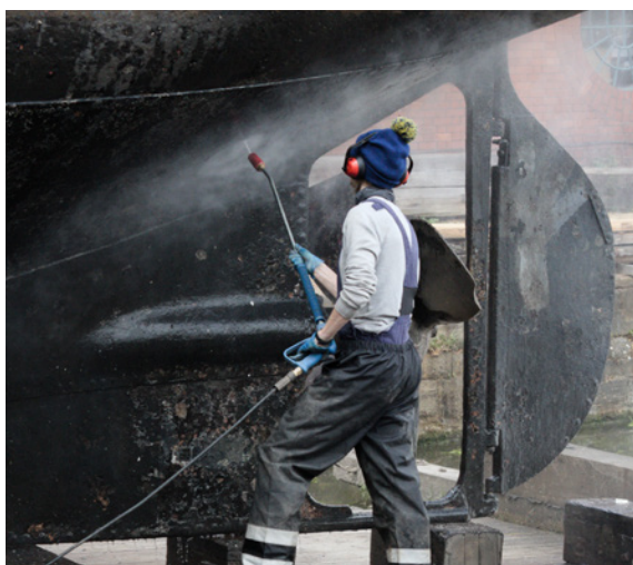
Powerwashing Mayflower , by Kaden Gardener.