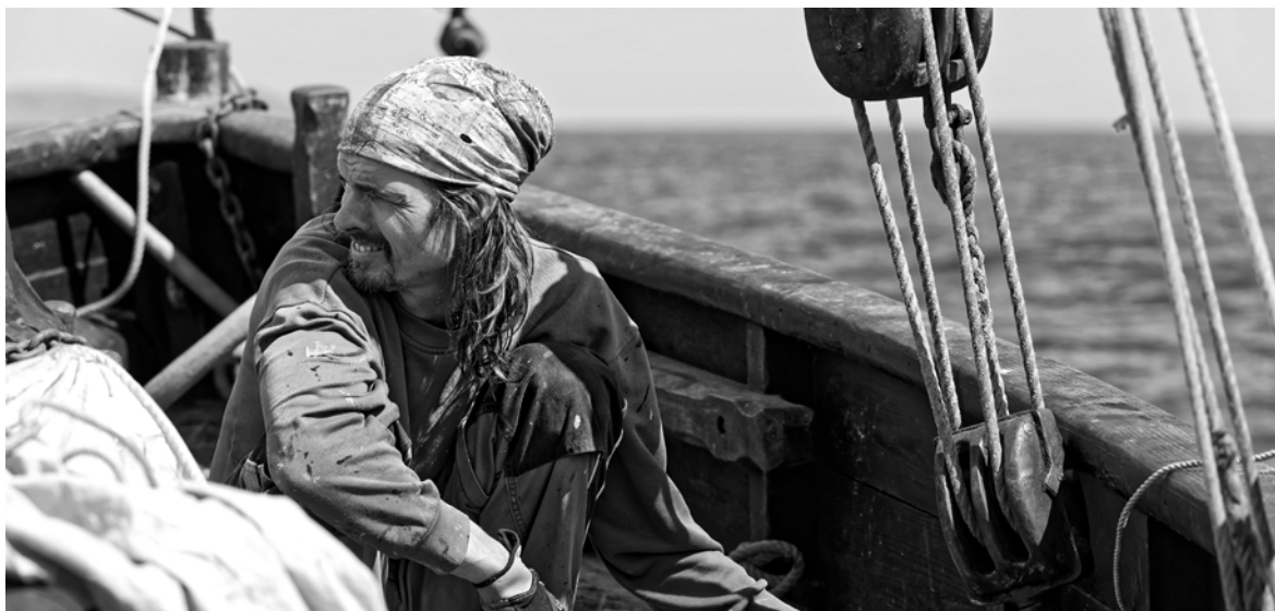
Ready to tack

Two Big Ship Forum sessions were held with a focus on interpretation and the use of AI, as well as international case studies in conservation. The Lug Rig Forum also met bi-annually and has grown in membership, facilitating UK-wide connections to encourage shared knowledge and learning. Throughout the year, we visited