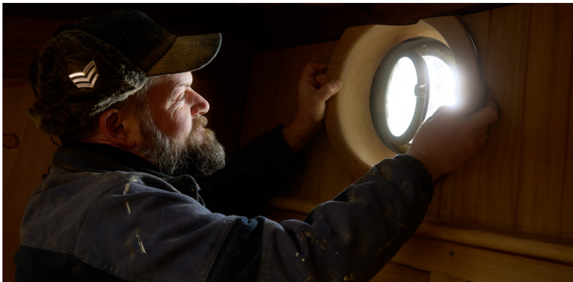
New porthole, by Greg White.