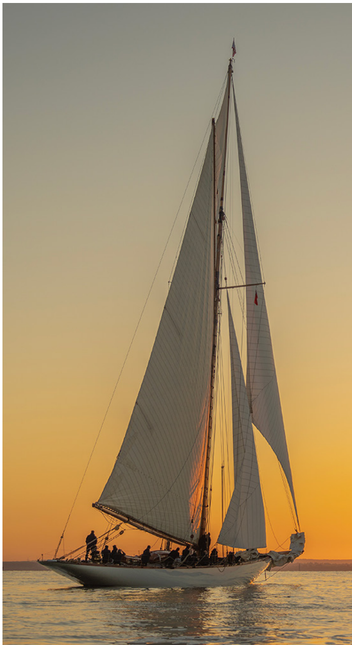
Mariquita at dawn