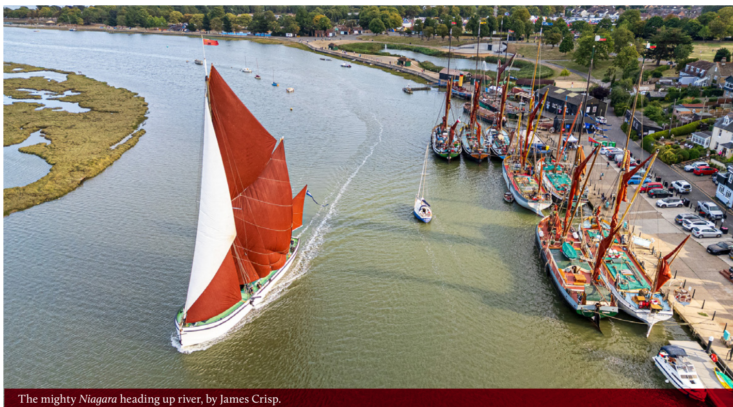
The mighty Niagara heading up river

more than 60 historic vessels and attended over 95 in-person or online meetings. Highlights included presenting at the UK Maritime Heritage Forum, a team outing on PS Waverley , taking part in the Heritage Debate, visiting the Southampton Boat Show and attending a garden party for the arts and heritage sector at Buckingham Palace.