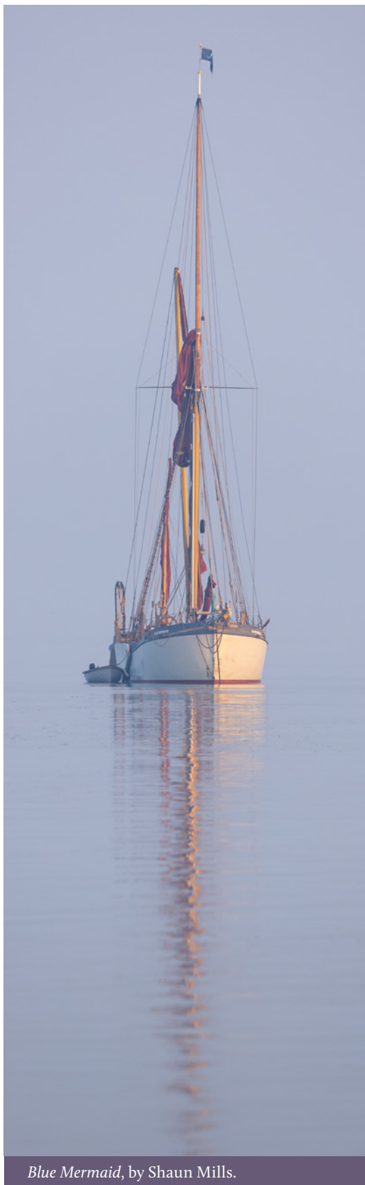
Blue Mermaid, by Shaun Mills.