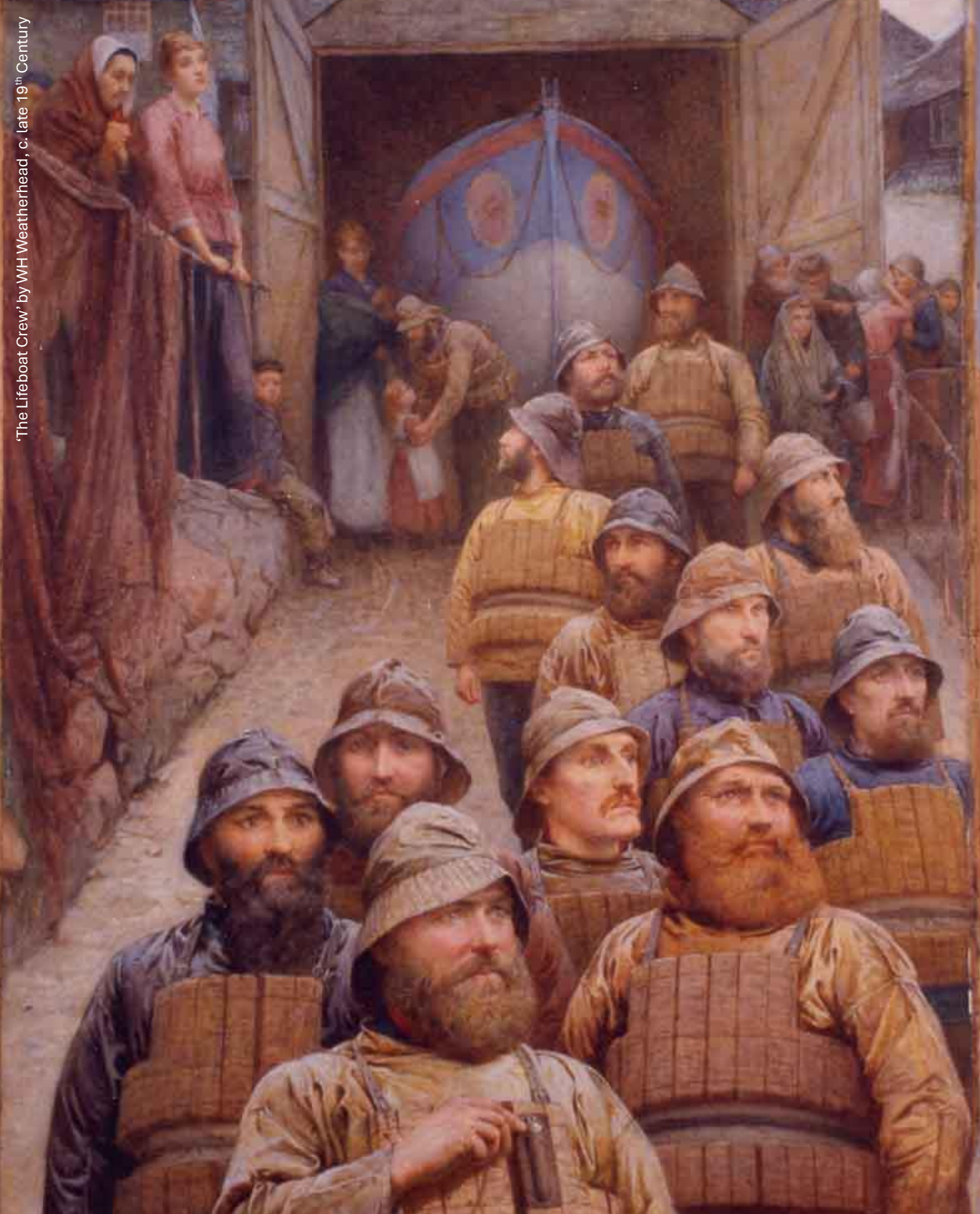
“The Lifeboat Crew” by WH Weatherhead, c. late 19 th Century