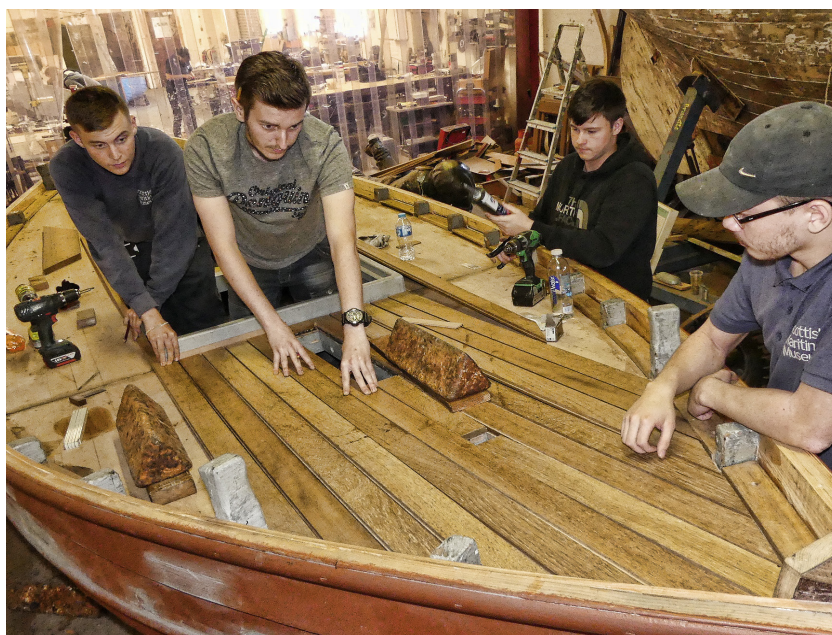
Planking the deck, by Alan Kempster.

To find out what your local hub can do for you, visit www.nationalhistoricships.org.uk/shipshape-network