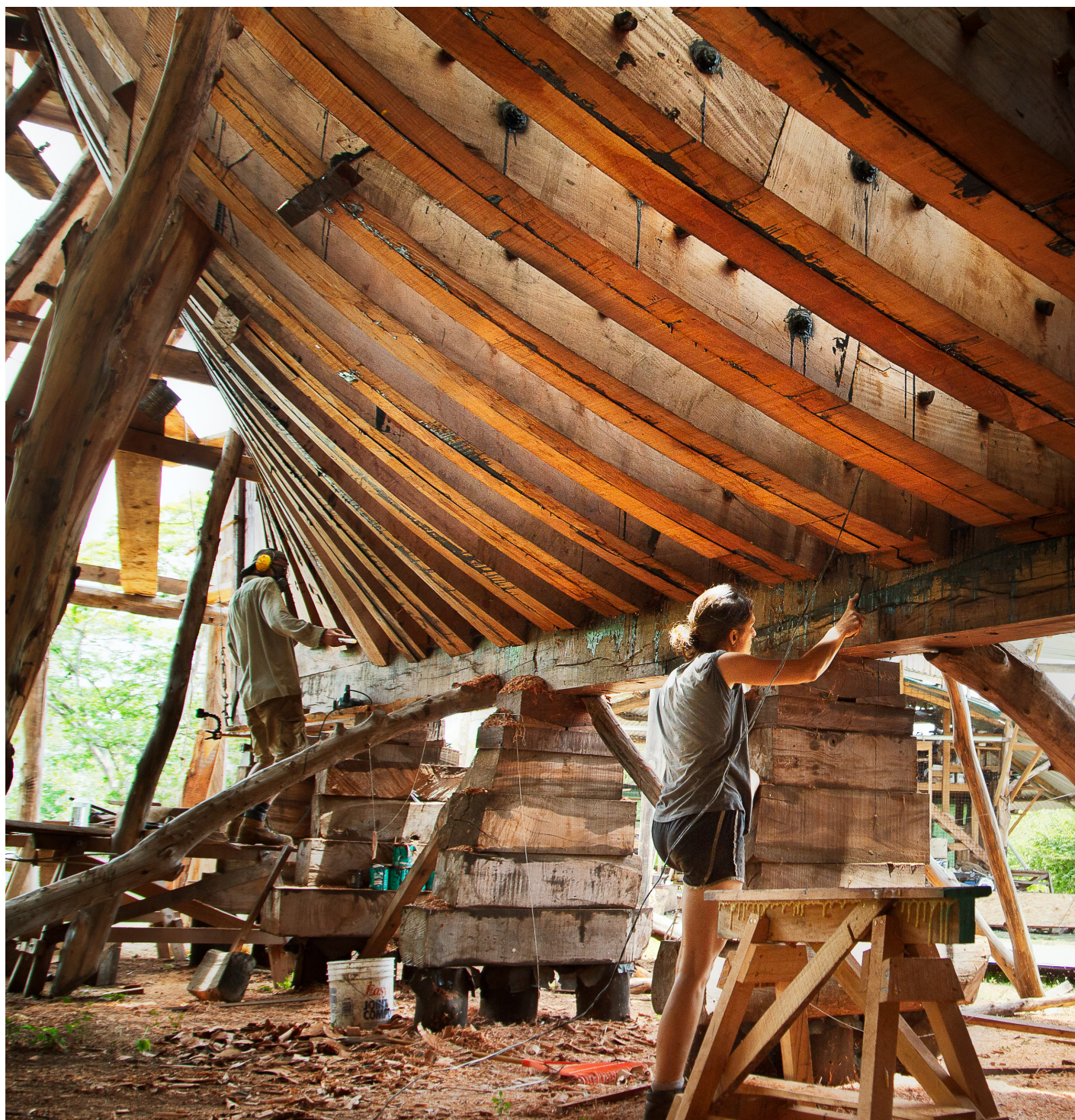
Ceiba in morning light, by Jeremy Starn.