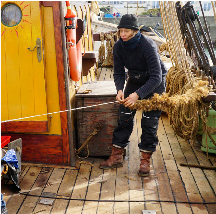
Making baggy wrinkles on board the Tres Hombres.