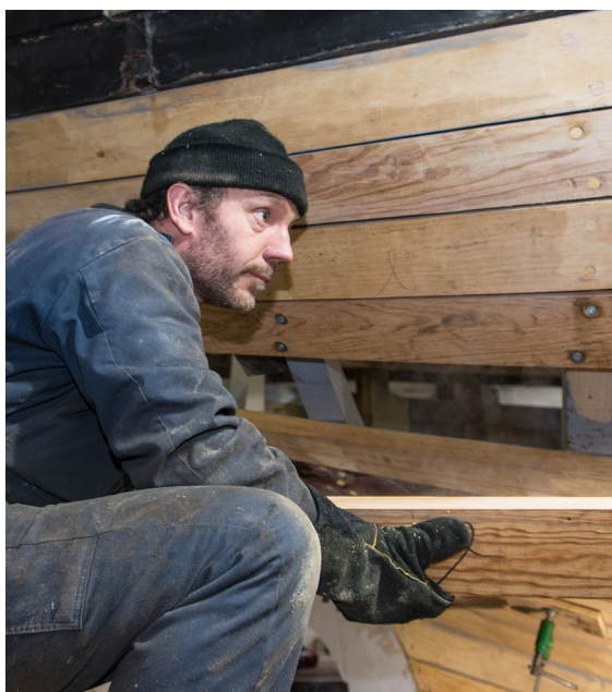
Fitting the shutter plank

saw mill to provide specialist cuts of timber to historic vessels, and delivered a variety of boatbuilding and maintenance courses through the college. The hub employed 11 people and created new opportunities in East Anglia.